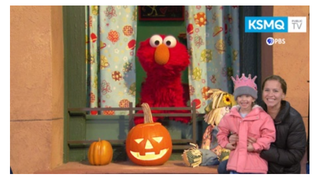
KSMQ held a Halloween open house at The Broadcast Center — with games, candy and a chance for children to pose with Elmo on our green screen.